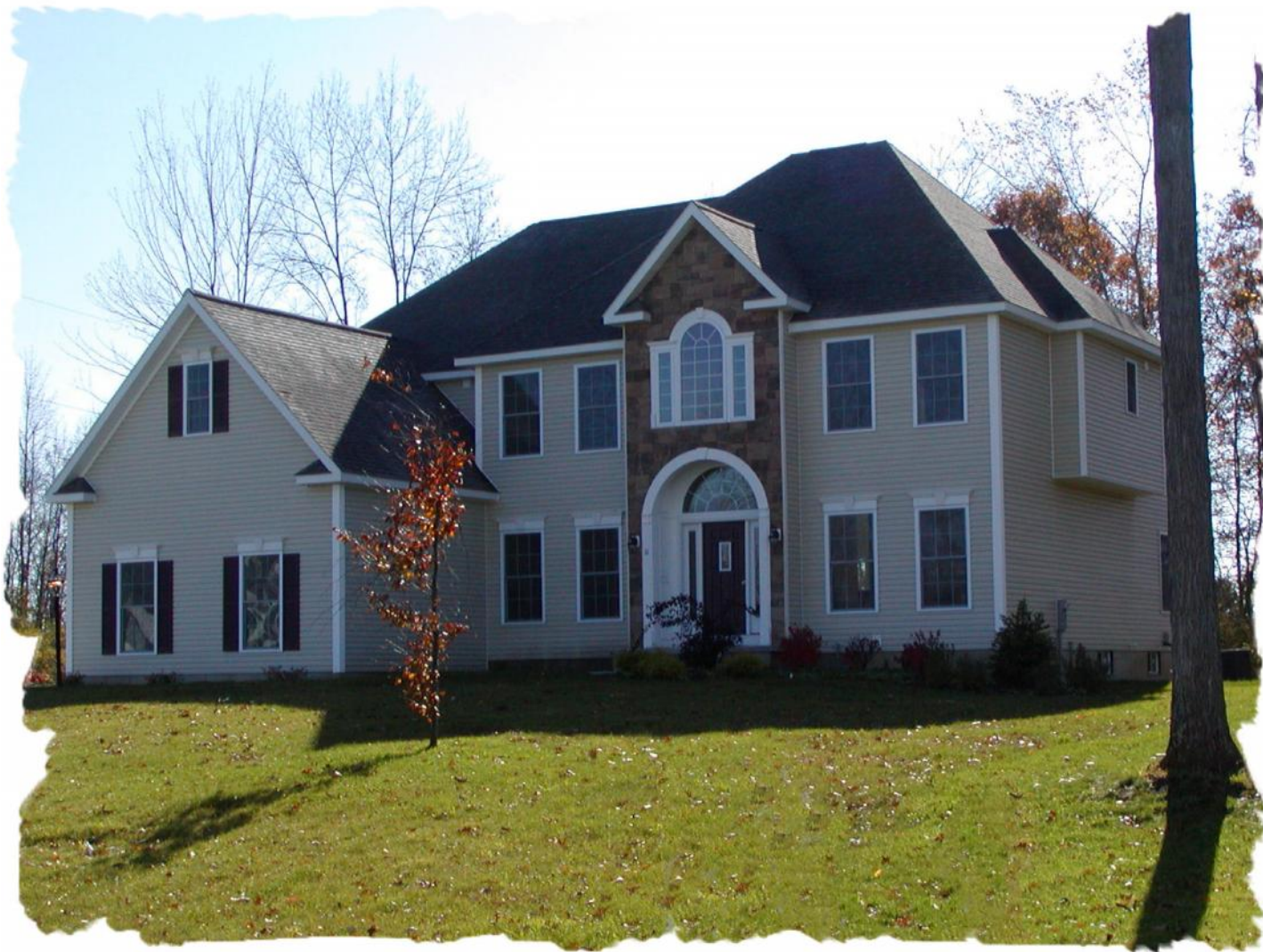
Photo shown with optional 3 car garage